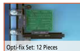
Opti-fix Set: 12 Pieces